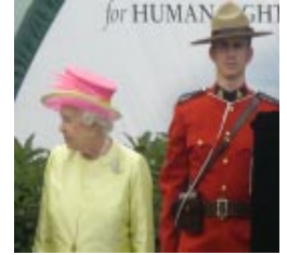
Her Majesty Queen Elizabeth II in Winnipeg.