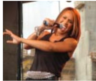
Deborah Cox, award-winning Canadian R&B star was the Pride headliner. She had the crowd dancing for over 20 minutes with her high energy performance.

The Manitoba Human Rights Commission again participated in Pride Mart and launched the Commission's most recent publication Protections from discrimination based on gender identity . Two hundred booklets were handed out in addition to website cards. This was the first year Pride Mart was held at the Forks and it drew a much larger crowd. According to organizers, 10,000 people took part in the city's biggest-ever Winnipeg Pride parade and festivities celebrating the city's gay, lesbian, bisexual, transgendered and two-spirit (GLBTT) community.